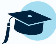
Tuition and Fees