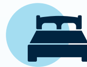
Room and Board