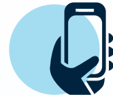
On The Phone

The fast way to receive withdrawal funds is by going to NEST529Advisor.com . Log into your account, click "Transact Online" in the upper left, select "Withdrawal", and follow the instructions. If you'd like to make a withdrawal by mail, download the Withdrawal Request Form from NEST529Advisor.com/forms , and mail it to the address provided. You can also request a withdrawal by calling the customer service center: 888.659.6378. When planning on a withdrawal, please allow 7-10 days for the proceeds to reach you or the school.